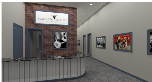
Lobby/Waiting Area Rendering

We appreciate the enthusiastic responses we received from everyone at Poppins regarding the amazing renderings provided by Cherry Creek. Thank you so much for your support on this incredible project. We are so ecstatic to bring this beautiful new space to our dancers and families.