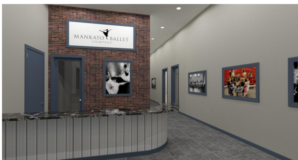
Lobby/Waiting Area Rendering

We appreciate the enthusiastic responses we received from everyone at Poppins regarding the amazing renderings provided by Cherry Creek. Thank you so much for your support on this incredible project. We are so ecstatic to bring this beautiful new space to our dancers and families.